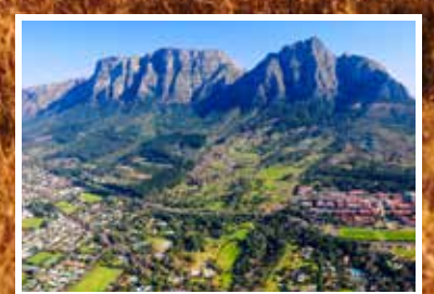
TABLE MOUNTAIN, CAPE TOWN