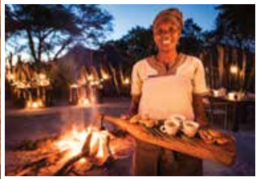
DELICIOUS OUTDOOR 'BOMA' DINNERS